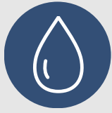
Sudden Roof Leaks

These are the ones we have heard the most: