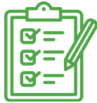
Detailed Roof Assessments

Our services encompass, but are not limited to: