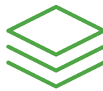
Commercial Roof Replacement