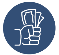
Costly to Repair