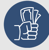
Costly to Repair