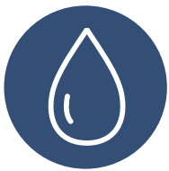
Sudden Roof Leaks

We prioritize strong relationships based on mutual trust, exceeding expectations in every project and repair. Viewing partnerships as long-term investments, we tailor services for maximum value. Collaborating closely with clients, we find innovative solutions together, dedicated to helping achieve goals. We support local businesses and organizations to make a positive impact on the community.