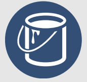
Paint & Drywall Damage

Roofing issues like leaks and structural damage can disrupt property operations and lead to costly repairs. They often cause inconvenience, raise maintenance expenses, and result in upset tenants. Do these challenges sound familiar to you?